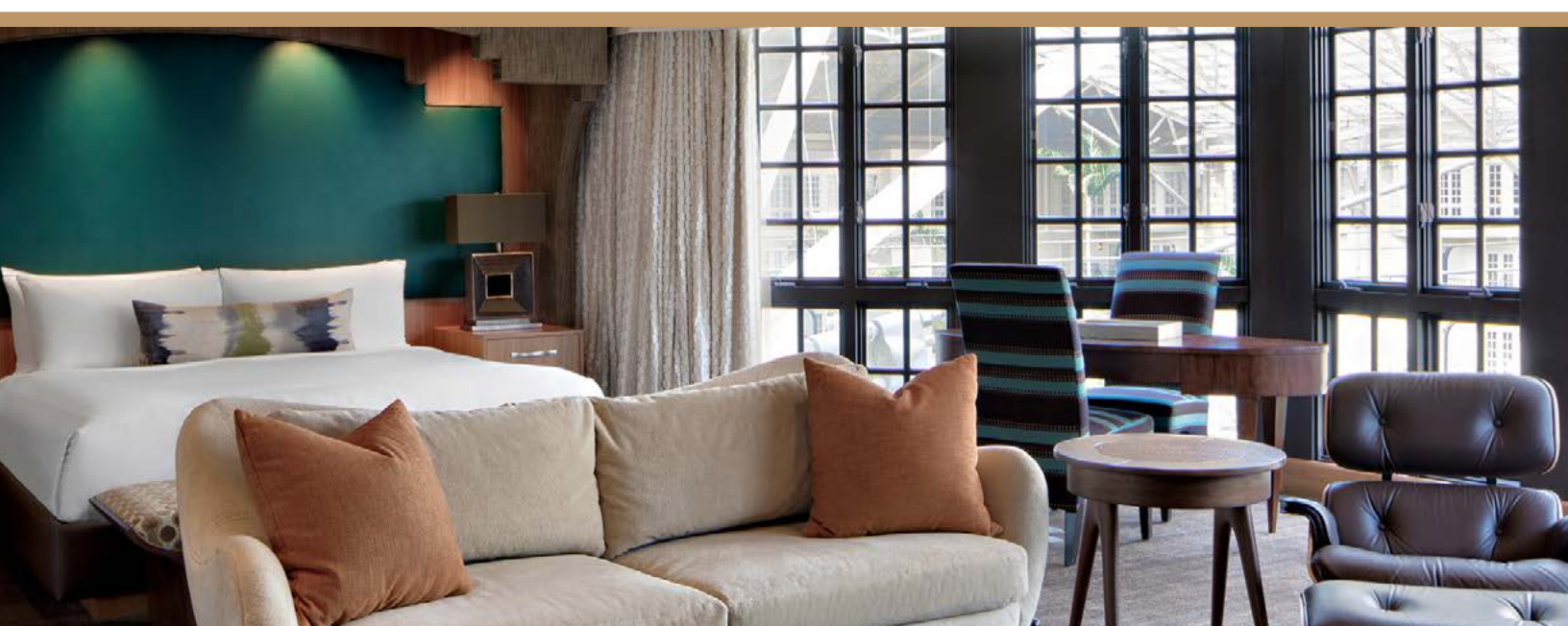
Gaylord Opryland Resort & Convention Center