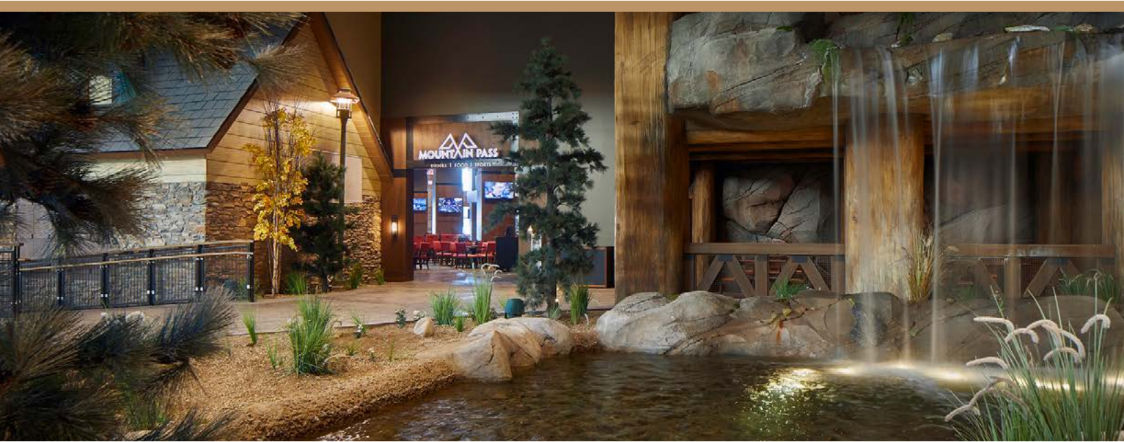
Gaylord Rockies Resort & Convention Center