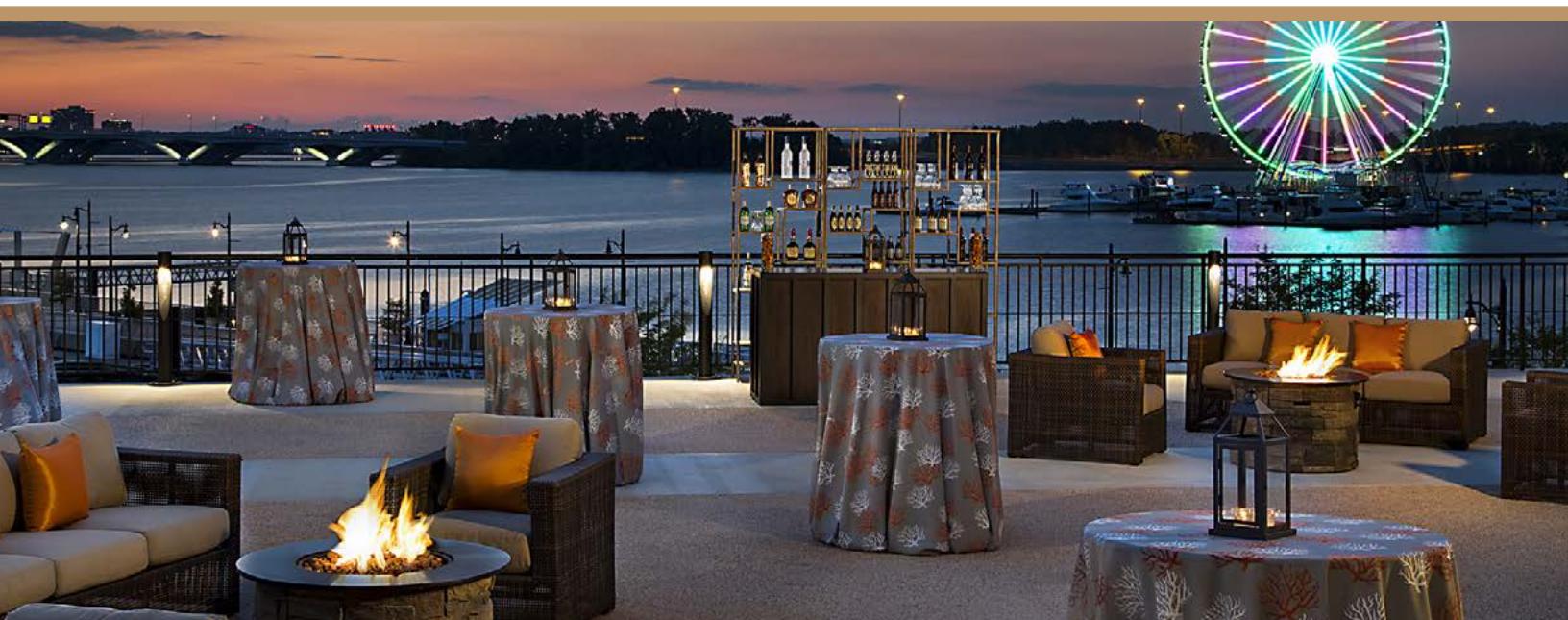
Gaylord National Resort & Convention Center

Our meeting, convention and event attendees are of paramount importance to us and new, comprehensive cleaning and sanitizing protocols have been designed to keep attendees, and our STARS, healthy and safe.