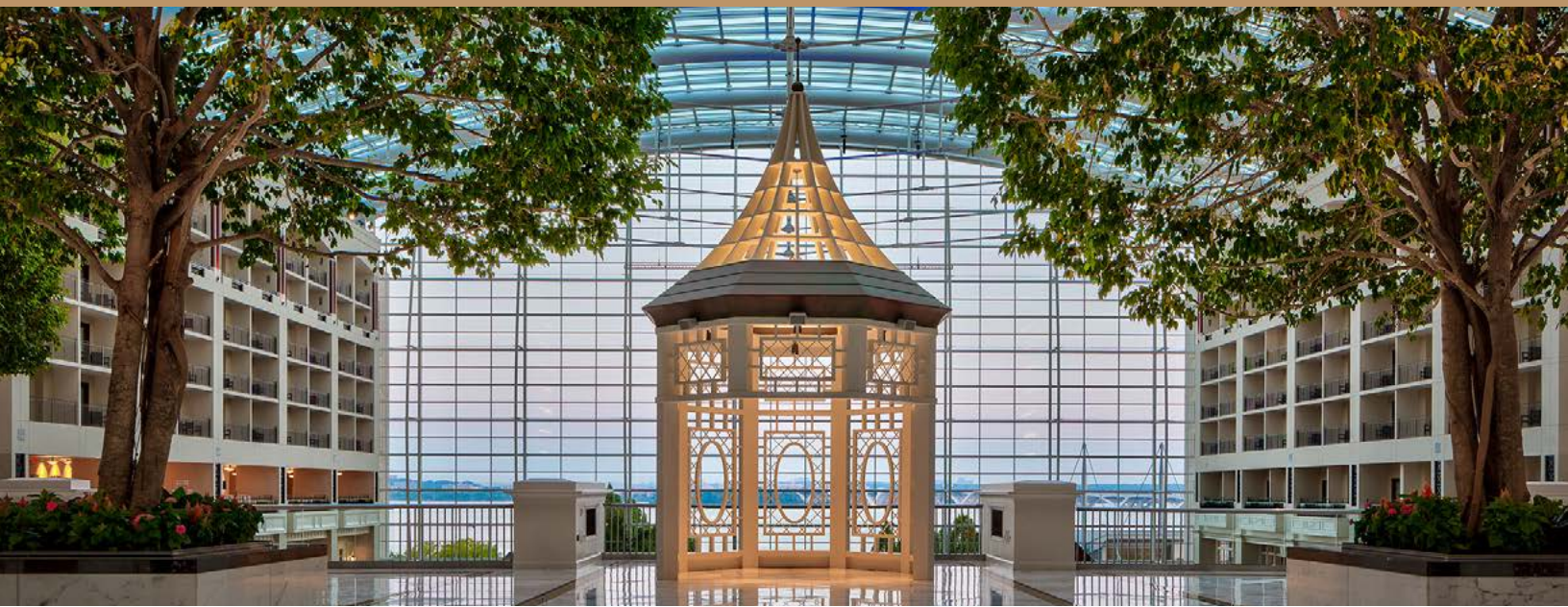
Gaylord National Resort & Convention Center