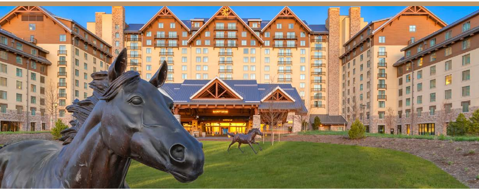
Gaylord Rockies Resort & Convention Center

We are also partnering with Ecolab , a global leader in infection prevention solutions with 97 years of experience, to ensure that we are taking appropriate measures to address a broad spectrum of viruses, including coronavirus (COVID-19). We are following the guidance of the Centers for Disease Control and Prevention (CDC), World Health Organization (WHO), and the guidance of our state and local health authorities regarding COVID-19.