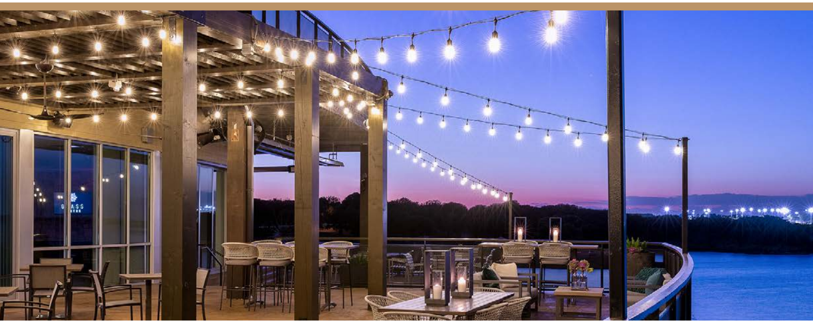
Gaylord Texan Resort & Convention Center