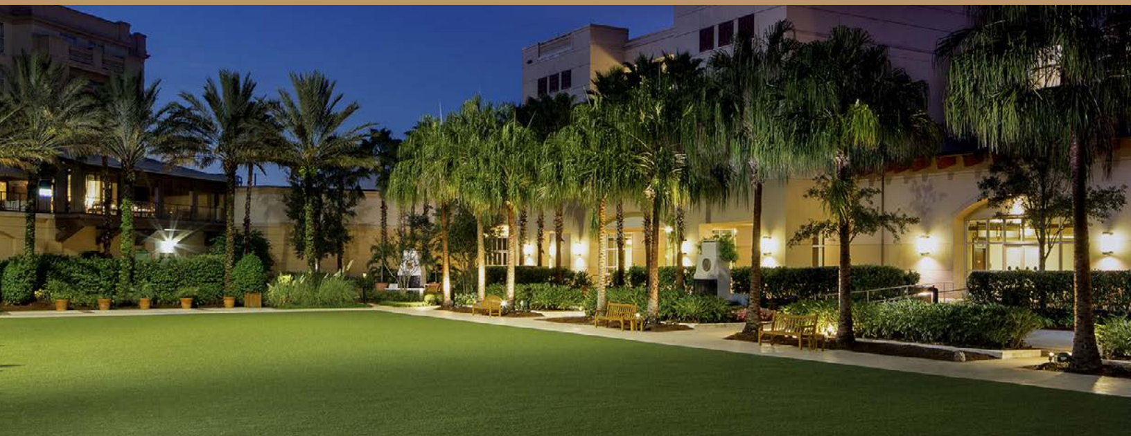
Gaylord Palms Resort & Convention Center

Guest Contact: We will be using signage throughout our hotels to remind guests to maintain social distancing protocols and will remove or re-arrange furniture to allow more space for distancing. In compliance with local and state mandates, occupancy limits and seating capacities have been reduced to allow for appropriate social distancing. We are adding partitions at front desks, concierge stands, and food and beverage service lines to provide an extra level of precaution for our guests; and, are implementing line management initiatives to reinforce proper social distancing. For the protection of our guests and STARS, we have implemented “upon request only” housekeeping service and no STARS will be permitted into guest rooms while a guest is present unless for emergency reasons. Masks and gloves will be available to all STARS.