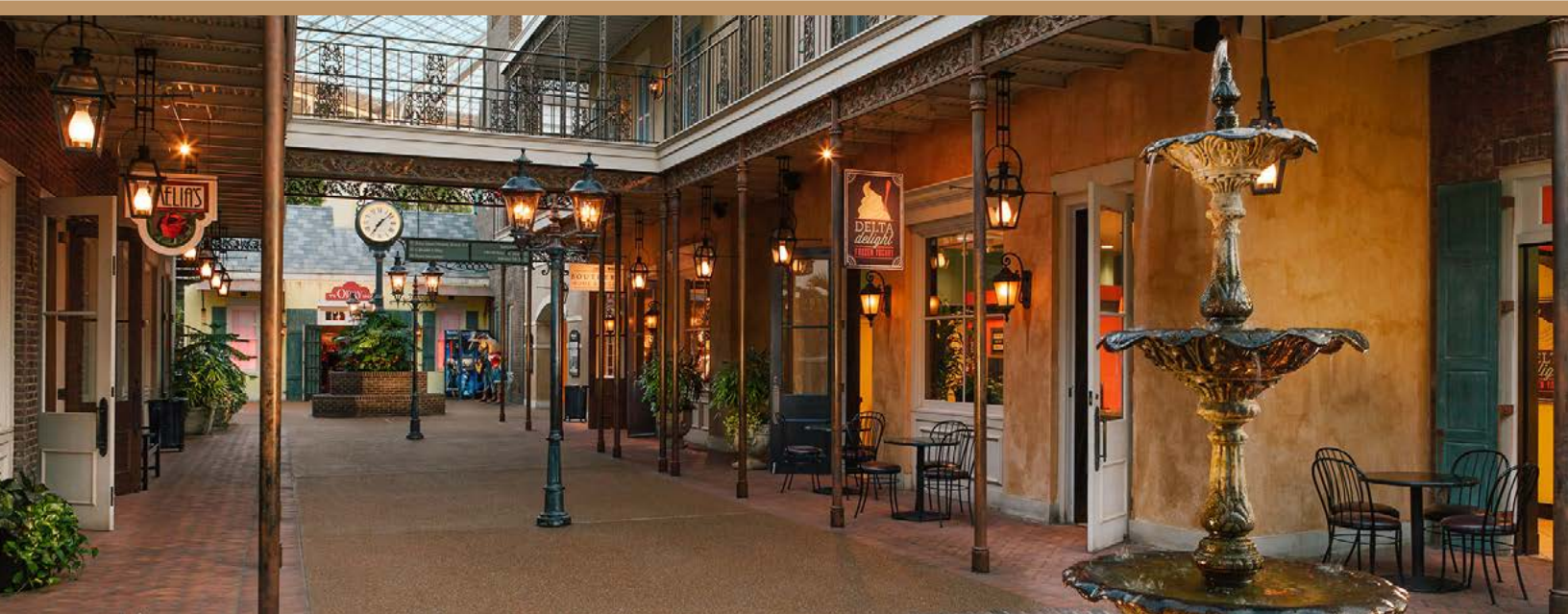
Gaylord Opryland Resort & Convention Center

The actions listed below are an overview of the specific protocols that have been implemented during this time. Each operating department has its own customized set of procedures and is built upon the guidance and consultation of infectious disease experts in the country. We will continue to refine and update our plan as our experts provide more information.